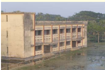
River dried up.

non feasible solution for the project. Bypassing the root cause of water logging, restructuring and rehabilitations of KJDRP was officially completed in 2004.